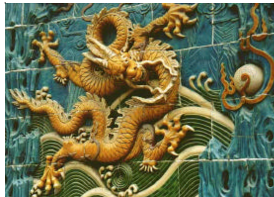
Center panel in the Nine Dragon Wall built in 1756, which is now in Bai-hai Park.

Various social activities and tours for participants including accompanying persons will be organized during the congress, such as a tour to the Great Wall, the Ming Tombs and