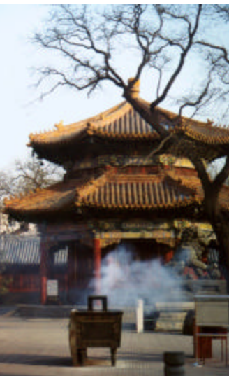
Lama Temple, built in 1694 as the residence of Qing Dynasty Emperor Kangxi, is now a Buddhist Monastery.

Two satellite meetings in Shanghai and Xi'an are planned before and after the congress. Details of the meetings will be provided.