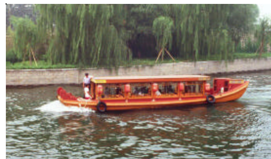
Boat on the Changhe Canal takes visitors to the Summer Palace.